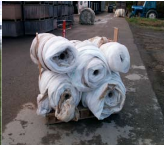
Storage on tubes?