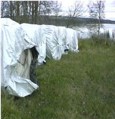
Storage on reels

Hiwer is run by one worker also under windy and wet conditions!